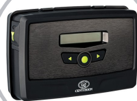
Mobile Phone Gate Access